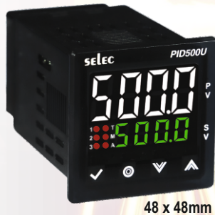
48 x 48mm